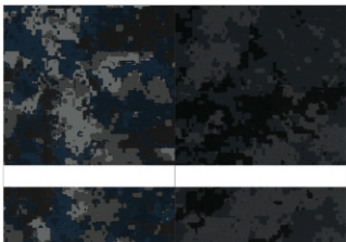
LM922-592 Digicam Navy/ White LM922-372 Digicam Special Ops/White

*Some LaserMax ® foils are not recommended for applications in which UV stability is a requirement.