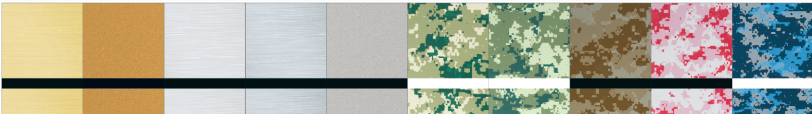
LM9X2-754* European Gold/Black LM9X2-714* Smooth Gold/ Black LM9X2-354* Br. Alum./ Black LM9X2-334* Br. Silver/ Black LM9X2-344* Smooth Silver/ Black LM922-982 Digicam Std. Issue/White LM922-922 Digicam Green/ White LM922-844 Digicam Desert Storm/Black LM922-694 Digicam Pink/ Black LM922-532 Digicam Air Force Blue/White