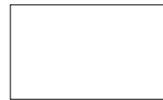
CB3xx-204 Chalkboard White