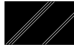
DE4xx-401 Dry Erase Black