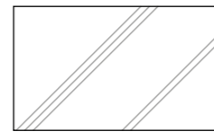
DE4xx-204 Dry Erase White