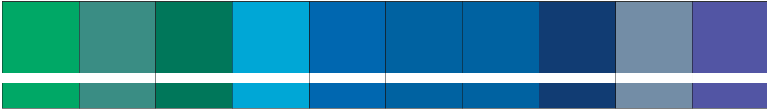
2XX-932 Bright Green/ White 2XX-972 Celadon Green/ White 2XX-912 Pine Green/ White 2XX-562 Light Blue/ White 2XX-502 Sapphire/ White 2XX-512 Blue/ White 2XX-572* Blue/ Bright White 2XX-552 Navy Blue/ White 2XX-382 China Blue/ White 2XX-582 Purple/ White