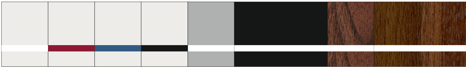
2XX-322 Light Grey/ White 2XX-326 Light Grey/ Burgundy 2XX-325 Light Grey/ Marine Blue 2XX-324 Light Grey/ Black 2XX-312 Grey/ White 2XX-402 Black/ White 2XX-412* Black/ Bright White 2XX-172* Walnut/ White 2XX-192* English Walnut/ Br. White 2XX-002* Black Walnut/ White