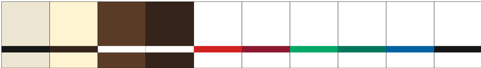
2XX-854 Almond/ Black 2XX-228 Ivory/ Dark Brown 2XX-822 Med. Brown/ White 2XX-842 Dark Brown/ White 2XX-206 White/ Red 2XX-226 White/ Burgundy 2XX-209 White/ Bright Green 2XX-269 White/ Pine Green 2XX-205 White/ Blue 2XX-204 White/ Black